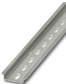
DIN rail, material: Steel, perforated, height: 7.5 mm, width: 35 mm, length: 1 m

Please be informed that the data shown in this PDF Document is generated from our Online Catalog. Please find the complete data in the user's documentation. Our General Terms of Use for Downloads are valid ( http://download.phoenixcontact.com )